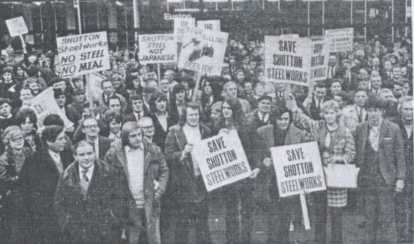
steelworkers demonstrate against closure in 1973

The paper from the DES is couched in woolly and superficially conciliatory terms. The proposals set up a machinery for long term control of Students' Unions. The only reply can be their decisive rejection. A Conference resolution is but a part of the assertion of the independence of the National Union of Students. The real point will be made by campaigns mounted on the issues facing the movement grants, outs, tutton fees - the conference of union automomy in defence of the Union's membership.