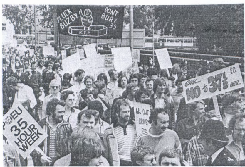
Members of the Post Office Engineering Union demonstrating in London as part of the action to advance their demand for a 35 hour week. This demand as an improvement in living conditions is gaining support as many recent trade union conferences have shown. The Post Office management is resisting the claim for reduced hours without loss of pay on the grounds that it is in breach of the guidelines which the POEU is correctly ignoring.