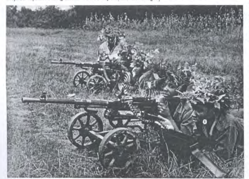
Zimbabwe freedom fighters training for guerrilla war against the Rhodesian regime

Back in the summer, hitherto unreported in THE WORKER, ZNLA forces attacked Mpakate Camp, in Chikombezi, killing 70 Rhodesian troops; and in the Gezani area hundreds of Zimbabwe patriots were released from Nazi-type concentration camps and resettled in the semiliberated zones.