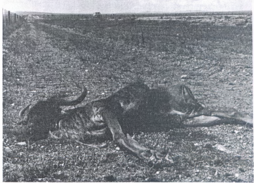
the Kenyan Government the profiteers rely on poaching.

ting socialism in those lands. What are we to make of Hua's visit to Yugoslavia and embracing of Tito in 1978?