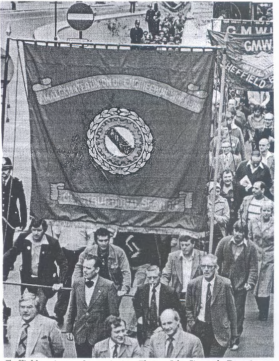
Sheffield engineers den nstrate

pound was seriously affecting export sales? Finance capital ists play monopoly on the Stock Exchange, not workers. Why won't the EEF criticise finance capital then? On productivity, hasn't the Engineering Industry Training Board found that most engineering machinery is well over 14 years old? Of course productivity is down but we thought employers were supposed to invest in new machinery. Why has investment been so low in Britain for 25 years? The EEF's advertisements, a sure sign of desperation, are an insult to the intelligence of engineering workers who know what is wrong with the industry