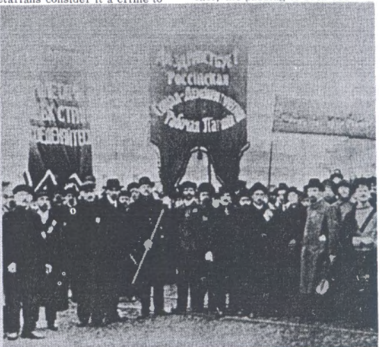
A Bolshevik demonstration in Moscow against the war. 'Workers of the world unite', ' Down with the war',

conference, Lenin wrote: "...in spite of the obvious importance of the question, in spite of the clear, strikingly manifest harmfulness of militarism, it is difficult for the proletariat to find another question on which there is so much vacillation, so much discord among Western Socialists .. ". The results of such vacil-