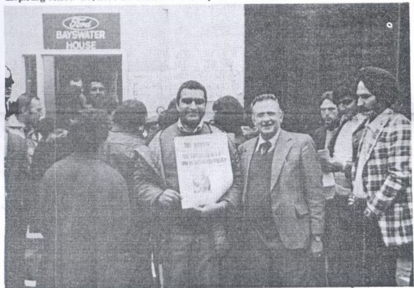
SHOP STEWARDS from Fords Daghenham support their negotiators in efforts to get more money from the employer, with no strings.

Ford workers solidly supported their negotiators in rejection of the latest final offer from the company. In voting to continue the strike they showed their contempt for the penalty clause the employers tried to smuggle in. In their struggle to smash the Government's 5% pay policy and restore collective bargaining, Ford workers are inspiring fellow workers all over the country to do the same.