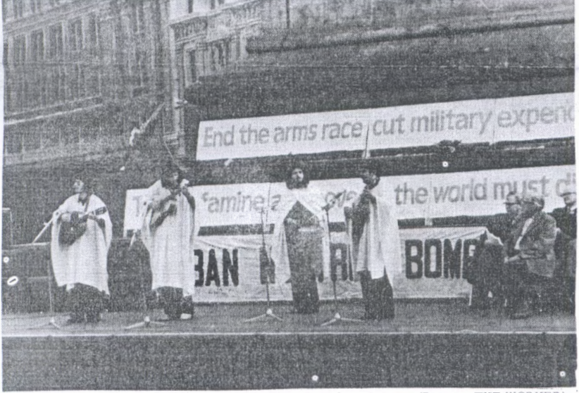
CHILEAN folk singers at a disarmament rally in Trafalgar Square.

ment wage fixing, for example, from dockers. Trucks which are all tending to disintegrate the ruling class's control of the situation. So when the ruling and prevented from taking loads class talk at this juncture of their inability to make war, they are really voicing their fear of revolution. Let us confirm all those fears.