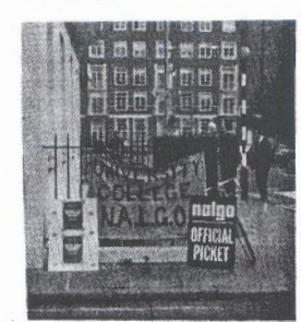
NALGO picket closes Leeds Uni-Photo: The Worker versity.

With a successful strike now under the members' belt, no longer is discussion about the morals of striking but about when and where and how to win