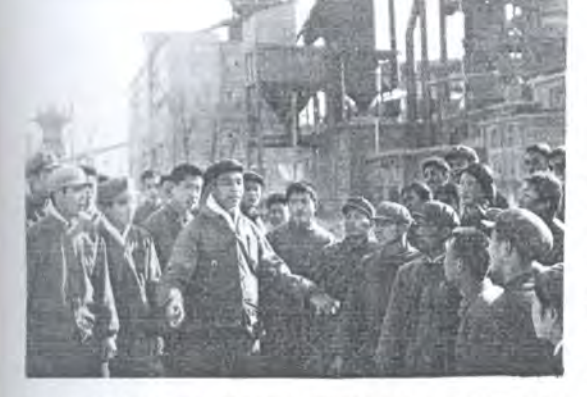
Workers at a steel smelting plant in Peking giving political education to students who are working and studying there.

All Albania's railways have been built by the country's youth.