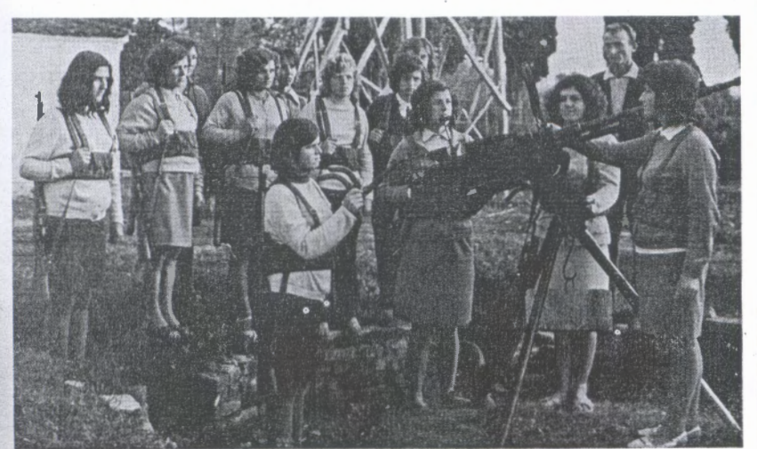
The defence of Albania is in the hands of the people - an armed proletariat to protect socialism.