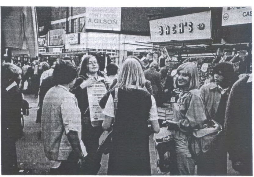
Pupils of Highbury Hill School seeking support in local Chapel Street Market for their fight against secondary school closures in Islington. Their vigour has inspired other schools and an extensive campaign against draconian ILEA proposals is well under way

It is estimated that the large universities could lose up to £1 million pounds per week in blacked income if the dispute is prolonged. Support from other campus unions, AUT, ASTMS; NUPE and NUS has been forthcoming.