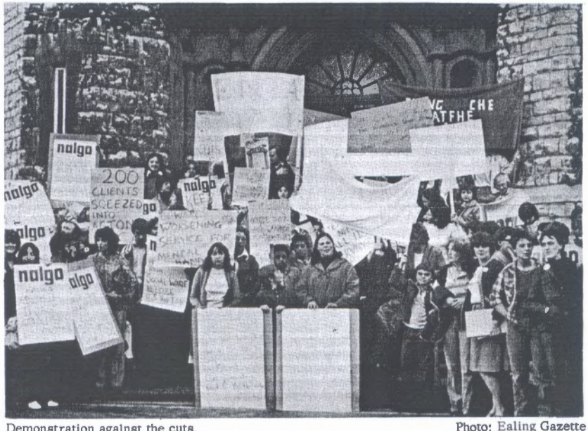
Demonstration against the cuts.

Published by J M Dent & Son Available from : The Bellman Bookshop. 155 Fortess Road. London NW5 £1.95 plus 20p pp