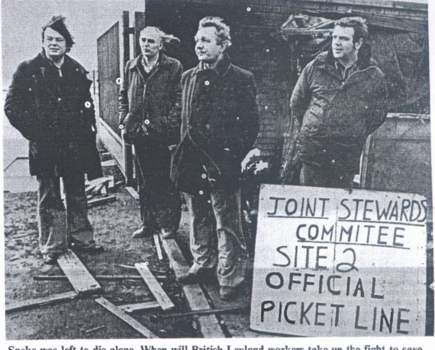
Speke was left to die alone. When will British Leyland workers take up the fight to save their industry?

BL will be bled dry unless the workers there save the mselves. They will have to organise and fight, get rid of Edwardes and his plans.