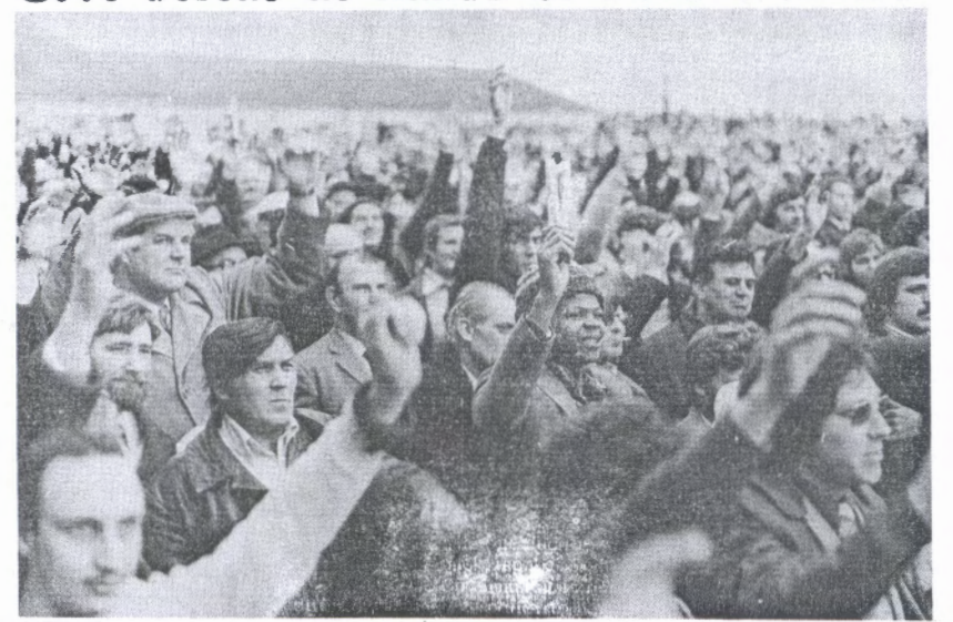
57, 000 walked out 9 weeks ago at Ford and 57, 000 return to work after their victory against the government.