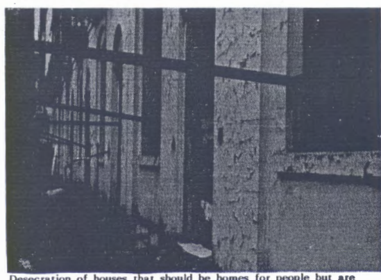
ecration of houses that should be homes for people but are left boarded up and useless for years.

The statement goes on: 'We want to see developed a carefully thought out and well planned policy, not just for homes but for jobs. A policy that is underpinned by a commitment to the principle that the provision of housing, like the provision of education and health, is a basic responsibility of any society to all of its member