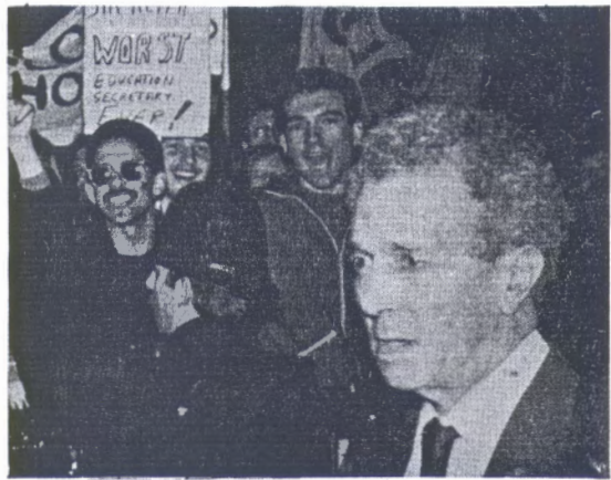
Keith Joseph visits Highbury Grove School.

languished for want of such parental involvement and support, which once assembled will not be easily dispersed. The long term aim is higher priority and greater resources for state education, so that our class can survive and rebuild after Thatcher.