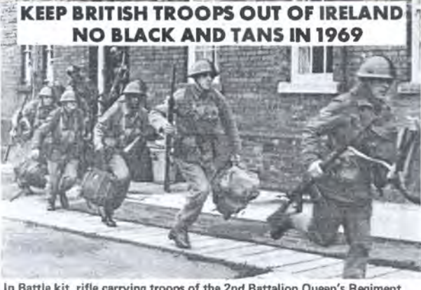
In Battle kit, rifle carrying troops of the 2nd Battalion Queen's Regiment sprint from a barrack block at Palace Barracks, Holywood, near Belfast, to board waiting trucks. They were leaving for guard duty at an undisclosed destination.

GeTy imperialism. Surely they will rally around the revolutionary banner of Marxism-Leninism to realise the promise of early struggles and carry class conflict through to the end.