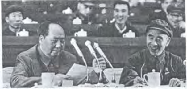
Mao Tsetung and Lin Piao

TWO industrial comrades of the Communist Party of Britain (Marxist-Leninist) have been invited by the Albanian Party of Labour and the Albanian Trade Unions to attend the May Day celebrations in Albania. They take with them warm fraternal greetings from their comrades here.