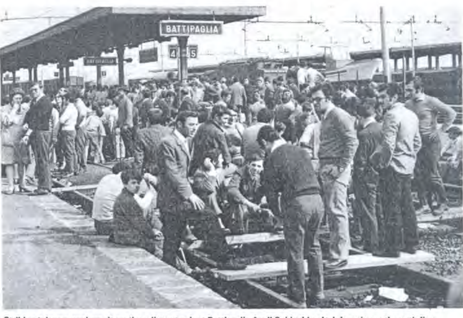
Striking tobacco workers sit on the railway track at Battipaglia April 9, blocking Italy's main north-south line

their very livelihood against the full might of the bourgeois state machine. The Italian Government has been stunned by the strength of the workers of Battipaglia and the amount of support they have received throughout the land. This was no "communist-inspired" plot — the Italian Party, corrupted by reformism, long ago sold out the workers and peasants — but a truly popular uprising. The closure orders have been reschieded. A victory for the workers even though their basic problems have not been solved and cannot be solved without a full-scale revolution. But the lesson of Battipaglia is vary clear. The violence of the capitalist class, using the might of the state, can only be met by the strength of the working class and its allies. To wait patiently and hope that MPs will plead for them in Parliament, or that commissions of enquiry will produce the necessary relief are only delusions. To fight closures, whether in Woolwich or Calabria requires the determined opposition of the working class against their enemy. Dare to struggle, dare to win."