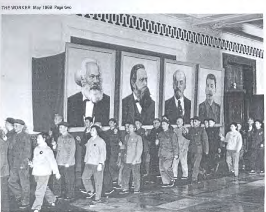
Delegates from all over China enter the meeting hall of the Ninth National Congress of the Communist Party