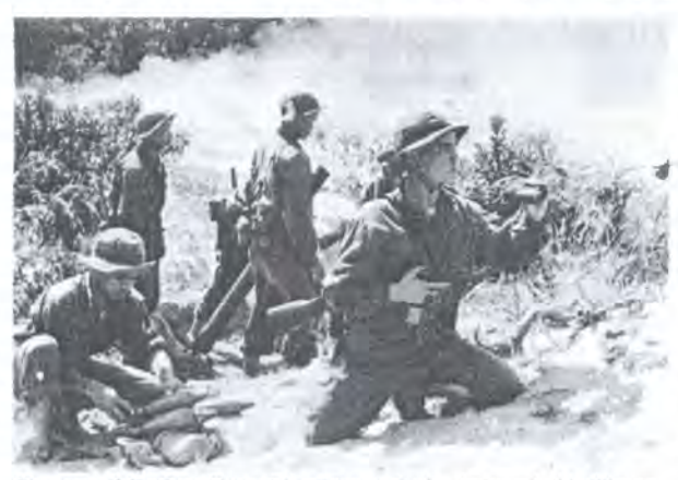
Gun crew of Northern Quang Tri artillery unit who destroyed a blockhouse and wiped out 51 enemy troops in a recent battle

Confronted with a rising tide of attacks, hellcopters destroyed, marines ambushed, ships sunk, oil depots blown up, Nixon has tried to carry out Johnson's strategy of dual tactics: blandishments to negotiate and compromise while at the same time stepping up the bombing and other acts of war against the people of South Vietnam.