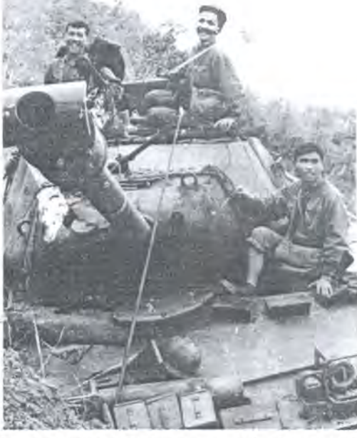
of the price the US-Saigon puppets paid for their invasion of hern Laos: 586 military vehicles of various kinds destroyed or captured. Liberation fighters riding a US M41 tank.

On this May Day, the day workers here and all over the world, we salute all those who have irrevocably committed them selves to the mounting class struggle in Britain. They will not retreat. They will not waver from the revolutionary road on which they have set their feet.