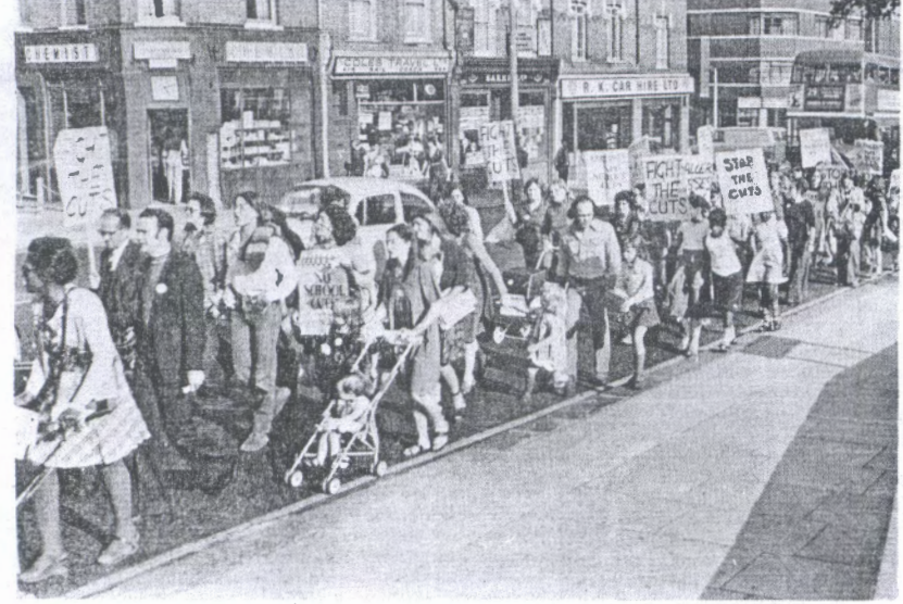
Parents and teachers demonstrating in Haringey last year against planned education cuts.

A student told THE WORKER after the meeting: "Some would argue that Kent students are wrong; they would try to persuade the student movement that if we surrender our autonomy, then the beneficent Labour Covernment will shower all kinds of benefits on our heads. Supposedly, since the independence of our unions is under attack. If we retreat, the attack will not hit us. But students are workers not privileged beings existing on 'public money'. Some forget the actions students have taken in their colleges over the years for a full and adequate grant and for the preservation of resources. It is because we are workers that capitalism seeks to smash our means of resistance. It is because we have raised the banner for education that they wish to remove our independence, if only we would permit it.