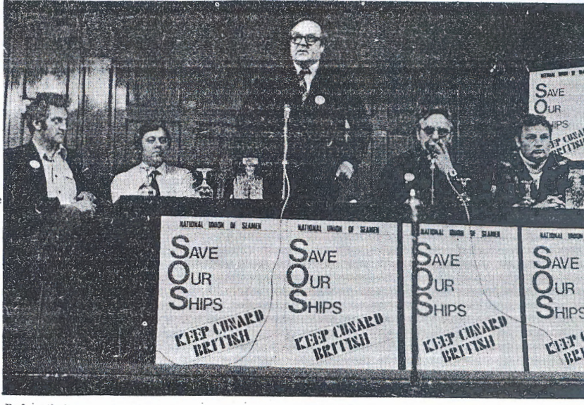
anently broken by punitive unemployment. Meanwhile, those who are feeling the pinch could shift their capital into commodity cheap labour'flags of convenience'. Seamen resisted, shortly before their current nationwide strike began, dealing or send it abroad. Before their present action, seamen had to fight Cunard, whose 'super patriotic'owners wanted to sail under who are feeling the pinch could shift their capital into commodity cheap labour'flags of convenience'. Seamen resisted, shortly before their current nationwide strike began, Photo shows NUS leaders addressing a strike meeting in Dover in November (Photo; Andrew Wiard; Report).

That the strong care for the weak and the healthy for the sick should be an assumption of any civilised society. This government is not civilised, it is as cold as charity.