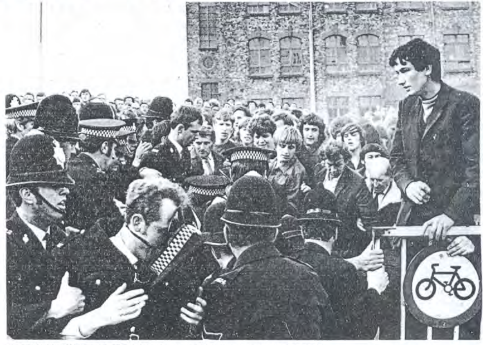
PILKINGTON STRIKERS DEFEND THEIR PICKET LINE AGAINST POLICE ATTACK

Mob Law! The determination of the workers, particularly when dealing with "black legs" openly encouraged by the G.M.W.U., resulted in charges of "mob rule." Such charges are always made when workers decide to "take on the gunor," but it is worth remembering that this so called "mob" are the same people whose sweated labour boosted Plikington's profits last year from £13 million to £20 million and who have made the Company's five directors among