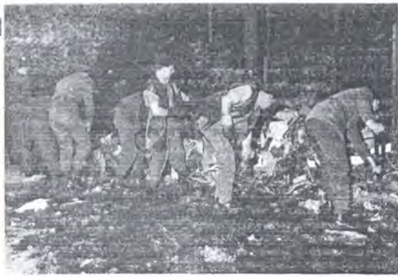
ONCE AGAIN LABOUR CALLS IN THE SCABS IN UNIFORM

Homelessness and bad housing conditions are as much an attack on our class as unemployment and need to be resisted just as strongly. Phoney offers of community consultations, self manage ment and the ilk are as empty and diversionary as workers' participation in industry. These concessions are merely a ruse to blunt the struggle of tenants, residents and community groups fighting for their right to a decent home and