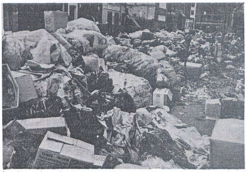
Capitalism produces piles of rubbish in a double sense, It forces the council workers who do the dirty job of removing rubbish to go on strike as the only way of getting a decent wage. Also, because capitalist production is for profit and not for the needs of people, it prostitutes the skills of workers to turn out rubbishy goods with built-in obsolescence which are a terrible waste of the world's resources.