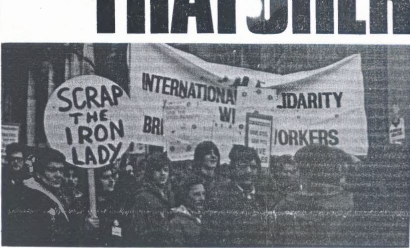
Demonstration to Stop the Tory So-called Employment Bill on March 9th.