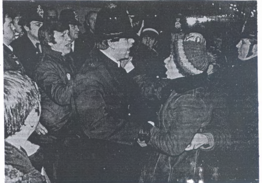
workers picket Corby