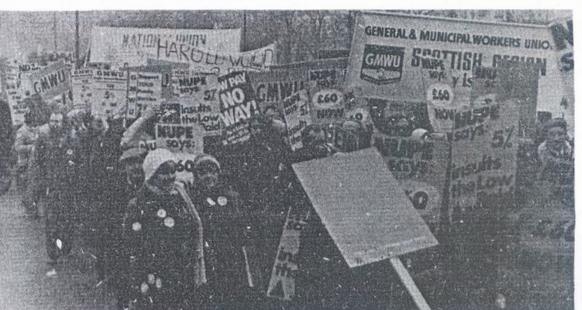
Day of Action" 22 January, 1979.

The workers at Leyland will have to organise themselves to prevent any further erosion. The fight to force more money out of the company must not become a further demoralising acceptance of this management plans. The working class will have to save Leyland and British industry from capitalist destruction.