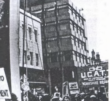
and a truer picture emerges What is an industry shrinking and growing ? Textiles in West Yorkshire, which closes factories and opens Industrial Museums

Bradford, Kirklees and West Yorkshire County Councils, estimated that by 1990 textile and related production will no longer exist in West Yorkshire -knock 5 years off that date