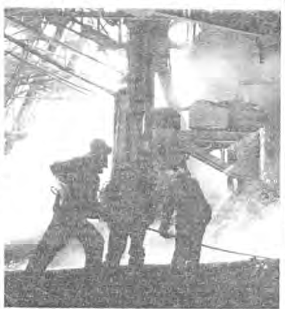
Workers at this Chinese Iron and steel company, because they work for themselves in a socialist country, applying revolutionary zeal to their tasks, have fulfilled the 1976 state plan ahead of time,

ceremony will begin at 11 s.m. and the alogan for the occasion is "Workers of All Lands Unite" It is planned that the ceremony will be followed in the afternoon by street theatre and musical entertainment.