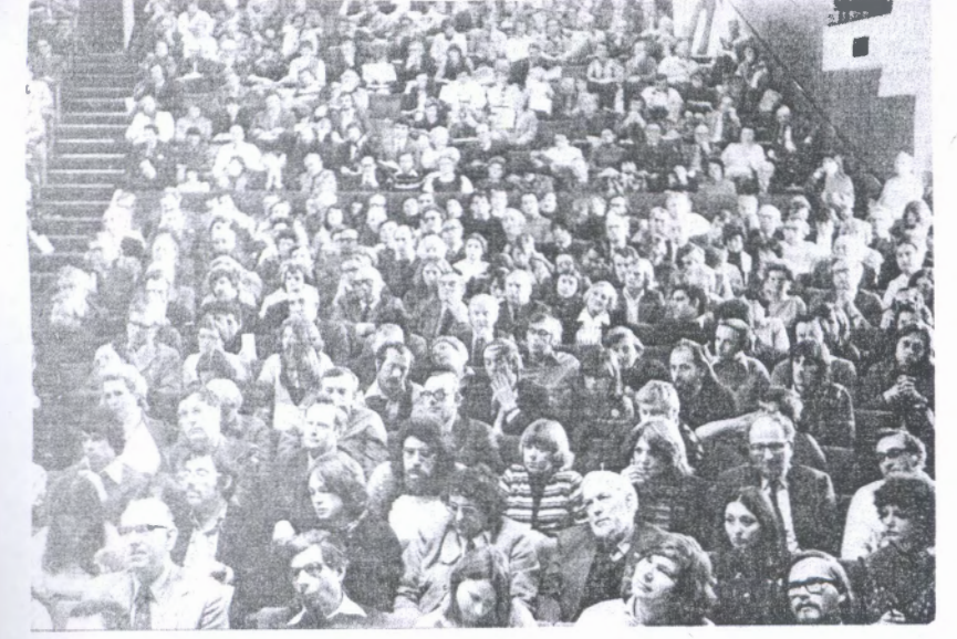
A section of the NUT Conference

LIVERPOOL May 1st 8.00 pm. Mitre Hotel (near Tunnel entrance), Dale Street, Liverpool. BRISTOL May 1st The Swan Hotel, Stokes Croft, Bristol 1 7.30 pm. NEWCASTLE May 1st 7.30 pm. Bridge Hotel Meeting Room No. 1, Central Library, Albion Street HULL May 2nd 7.30 pm. Room 102, Park Lane College, Hanover Way, Leeds 3 LEEDS 7.45 pm. 7.30 pm. MANCHESTER May 2nd Millstone Hotel, Thomas Street, Manchester 4