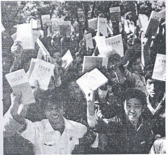
The fifth volume of the works of Mao Tsetung has come out in