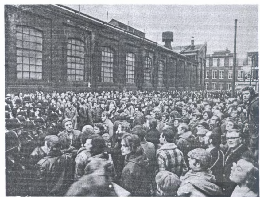
The steel pickets who persuaded the workers at Hadfield's, Sheffield, to reverse their decision to go back to work and come out in support of the steel strikers.

The working class is gathering its strength to hit back. The first step is to recognise the main class contradiction and isolate the main enemy - Thatcher Out. Of all the battles workers are waging up and down the country the same thing can be said that the steel worker picketing Hadfield's said: "The pay claim is second now - this is a war on her in Downing Street."