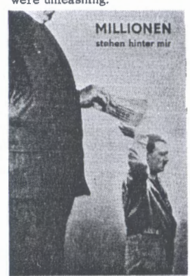
DER SINN DES HITLERGRUSSES

A look at any of his works will prove how fir he achieved his stated sim of "contrasting the high-sounding and deceptive words of the nazis with the reality of terror and war they were unleashing.