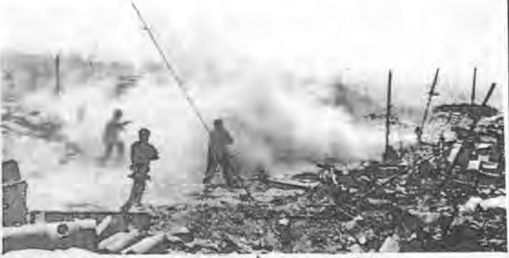
Vietnam liberation infantry charging the enemy on a hilltop

of noticeably pooret quality, and we apprec-late the size and scope of the unending battle that building technicians, engineers, surveyors and all other workers are waging to uphold the quality of life, under the rule of: a bowler-hatted mafia.