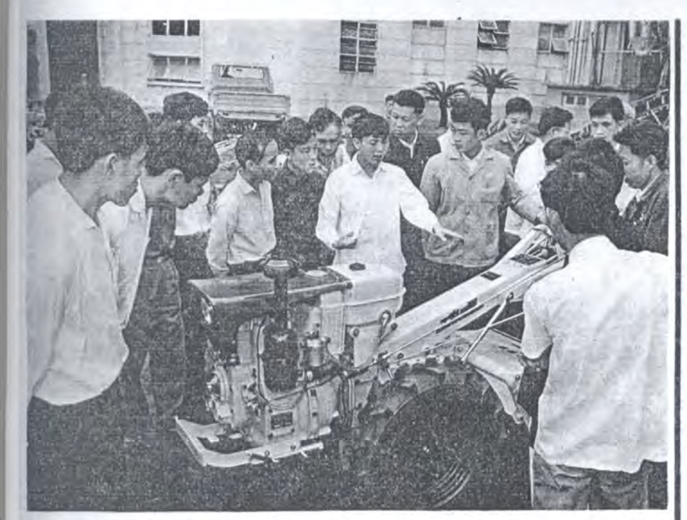
Chinese workers show Vietnamese comrades-in-arms a hand tractor at the commodities fair