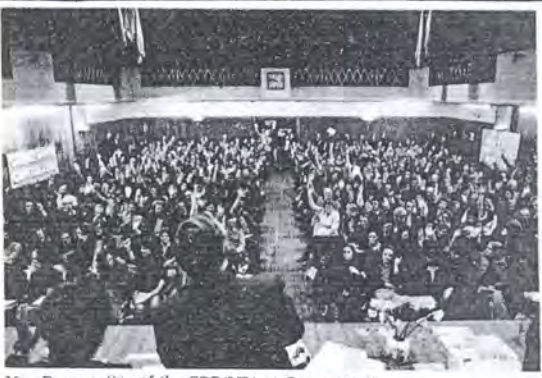
May Day meeting of the CPB(ML) at Conway Hall

Our fight against the Common Market is on political not economic grounds. We make no