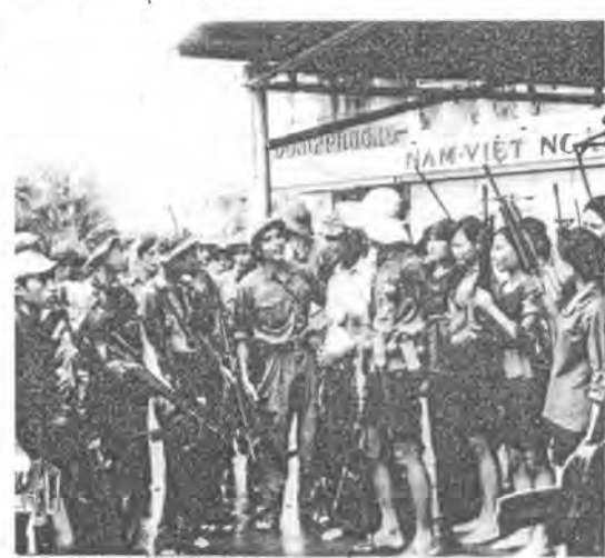
The heroic militia of Hue meeting liberation fighters in order to discuss new tasks.

"Our compatriots in the North and South will be reunited under the same roof. Our country will have the remarkable honour of being a small country which in a heroic combat defeated two great imperialist powers - the French and the American - and made a worthy contribution towards the national liberation movement.