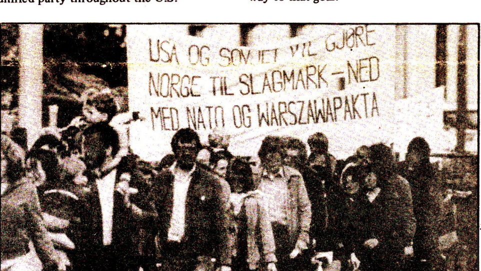
NORWEGIAN demonstration condemns superpower contention in Europe.

A representative from the West German youth organization Red Guards said that, "Being a communist youth organization, we fight in the front lines of working-class youth. Our activities are concentrated wherever proletarian youth are found. That