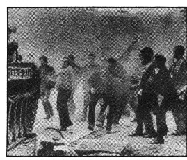
Czech patriots resist 1968 invasion. (Klassekampen)

Whether the Republican Party will be split and a third party founded by the Reaganites, the conventions showed that U.S. imperialism is headed down the road of inevitable world war with the other superpower. Beneath the talk of "detente" with Brezhnev lie massive war preparations, continued aggression in all corners of the globe and a continued shifting of the burdens for the present capitalist crisis onto the backs of the working people.