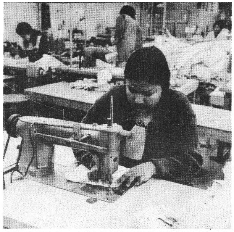
Millions in profits are taken from the labor of foreign-born garment workers in sweat shops such as this one.