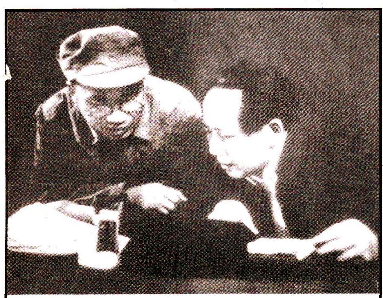
Mao Tsetung and Chu Teh in 1937.

The banking and real estate capitalists are notorious for their practice of "red-lining"—denying loans and housing to Blacks in white areas they wish to "stabilize" as "whites only" areas. At the same time, they promote ra-