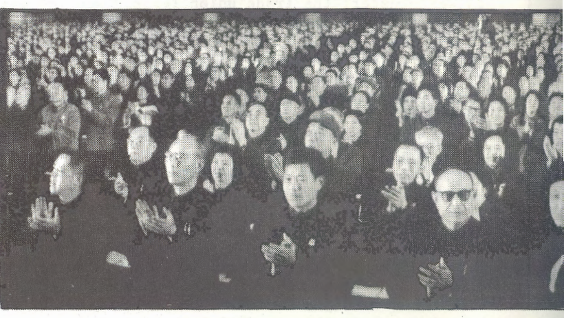
China's National People's Congress - the highest political body, whose delegates are all accountable to the people wh 21% peasants, 14% PLA members, 13% revolutionary cadres, 1 returned overseas Chinese. All of China's national minorit

The proletariat, however, in its class struggle against the bourgeoisie openly declares its inten-