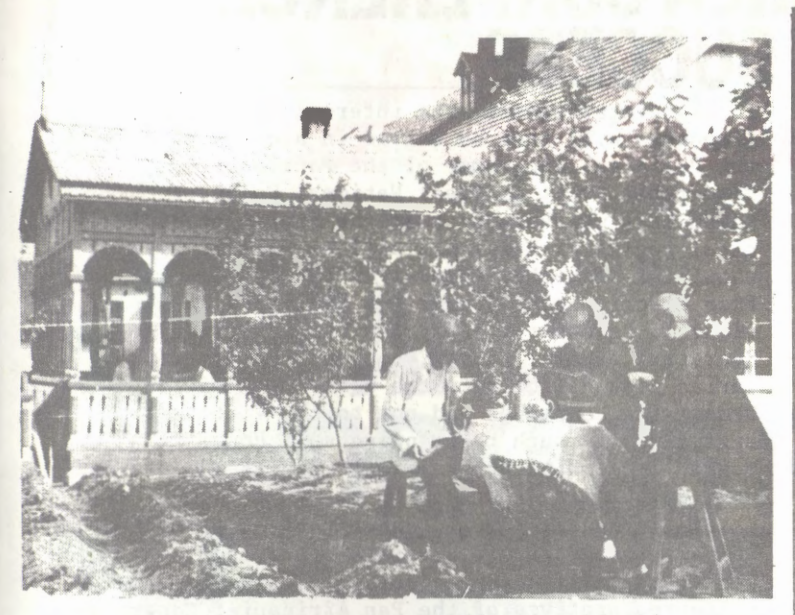
Retired timbermen, down-trodden in old China, live a happy life at a home for the aged.

abolished once a building is paid for. Old people pay no rent. One family I remember with a father, mother, daughter and son-in-law and two other children, - three wage earners - earned £32 per week. Well, they pay no rent and food is very cheap in the markets. They have big Friendly Stores in the cities, but otherwise it is mostly markets and shops. Prices are fixed, and if shopkeepers go over certain prices, they get pulled up. In the house I just spoke of they had a record player and a radio.