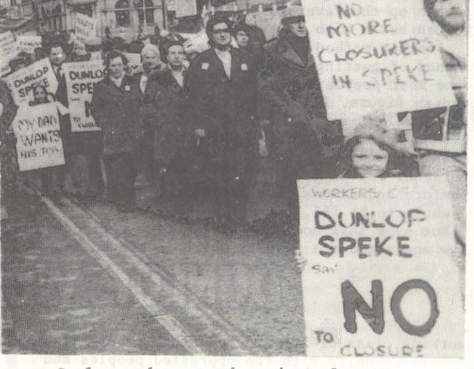
Dunlop workers march against closures.

The unity of Dunlop workers at Speke to stop the closure and not accept redundancy pay is high. Speeches opposing the selling of jobs for "thirty pieces of silver" as selling not only their jobs and the jobs of their children, invokes immediate app lause from Speke workers. So far only 83 out of 2,500 have accepted redundany and left. the rest are staying on to fight. In their struggle they are getting selfless assistance from unemployed workers who once worked at the Leyland TR7 plant and who still keep up a branch of the T&GWU. They have formed a community picket at the Dunlop plant in order to stop movement in and out of lorries collecting finished goods from the warehouse. Lorry drivers refuse to cross the picket line - so nothing moves. This is a new form of struggle developed by the Speke workers which will certainly strengthen the chances of victory in this struggle against closures.