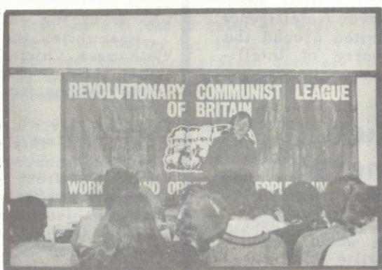
Message of the Proletarian Party of Iran being read to the rally.