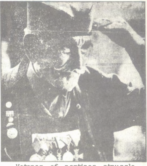
Veteran of partisan struggle pays last respects to Tito.

"All that which Yugoslavia is today, all that which we are proud of, that which we are developing and are determined to defend with all our strength, incorporates Tito's deeds".