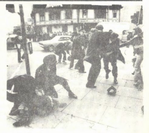
SOUTHALL, April 23rd 1979. The British state shows its determination to provide Nazis with the freedom to organise.

The mood of the march was militant throughout, however.