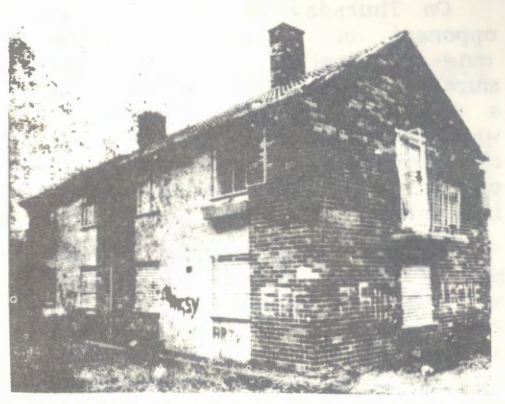
Liverpool City Council prefers to spend money on vandalising properties and bricking up their windows rather than on repairs.

By Wednesday of the next week our consistent harassment won the day. They handed over a key to a house - a house that