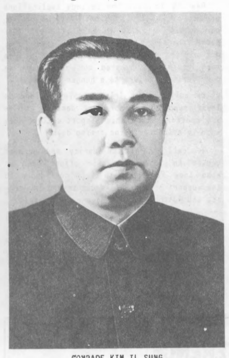
COMRADE KIM IL SUNG.

danger of a new world war breaking out because of the scrambles among the dominating forces to subjugate newly independent countries again and take hold of the major zones of natural wealth and areas of strategic importance.