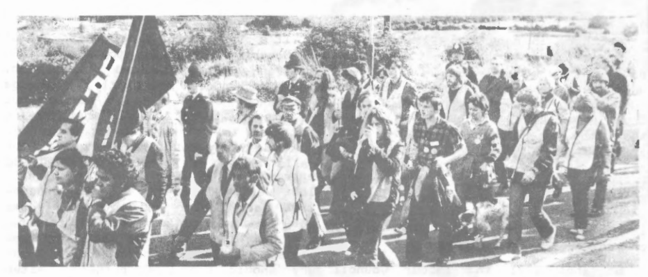
Workers march through Derbyshire during October in one of a series of Right to Work Marches organised by the Trade Unions.

In the past year alone (up to June 1981) the output of manufacturing industry in Britain fell by 9.8% (almost one tenth); output per worker increased by 1.3%. It doesn't take