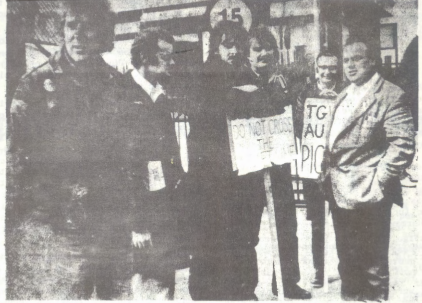
A group of pickets outside BL's Cowley plant at the end of October, in dispute over lay-off pay.

Each year Edwardes has refused to negotiate. He has stated what the pay rise will be, and threatened redundancies if it is not accepted. Up to now, with Union connivance, particularly that of the AUEW leadership, he has got away with it. the wage cut has been pushed through, and redundancies have still followed. This year, at the time of writing, picture looks very different. A massive 88 out of every 100 workers have voted for strike action over their £20 a week claim. The strength of shoop floor resistance has led to the national union leadership declaring their support for the workers decision. Duffy, the AUEW president, has said that the union will pay £12 a week strike benefit. But Edwardes still has the experience of and ability to split workers, and there must be read-iness on the shop floor to stand against it. It is likely that British Leyland will offer further 'productivity payments' as the main part of its answer. In which case it must be remembered that British Leyland plans are reducing the number of cars