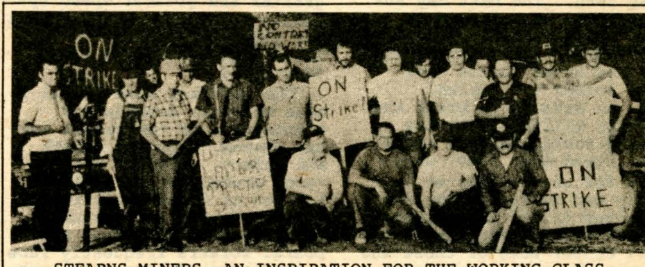
STEARNS MINERS--AN INSPIRATION FOR THE WORKING CLASS

pansion into new areas. The determination of the Blue Diamond Coal Company, J.P, Stevens, Coors, Farah, etc. adequately demonstrates the fact. The battle at Stearns is the key to opening up the rest of the unorganized miners in Eastern Kentucky and in the southern states. The effect of non-union mines was dramatically felt in the last national strike. In Eastern Kentucky there was no decline in coal production during the strike whereas it fell to as low as 2% in some organized states like West Virginia. A victory in this strike insures progress in the effort to organize; a defeat dampens it.