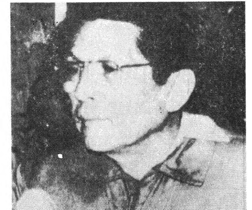
Lt. General Fidel V. Ramos and Defense Minister Juan Ponce Enrile announce their break with President Ferdinand Marcos.

The U.S. then realized it had to pre-empt mass mobilization, and shortly thereafter Enrile and Ramos acted. Agilely adapting to the anti-Marcos movement, the administration tried to pretend that the results were what they wanted all along, and the media loyally allowed those claims to stand. But the habits of propping up a dictatorship die hard, and after having gotten some agreement from Aquino on protecting Marcos the Reagan administration immediately botched his departure. Five administrations have known for twenty years that Marcos and his clique have stolen everything but the copper pipes. The scale of this plunder is unbelievable. Combined, it may come near to the total Philippine foreign debt, and even by the most conservative estimates, it would