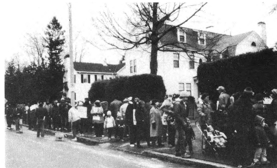
USWA Local 8751