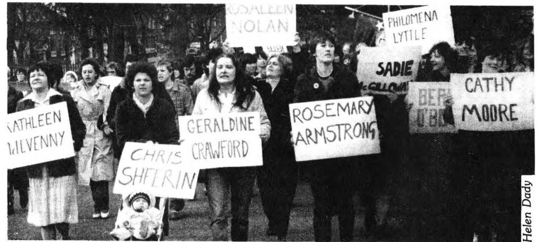
Relatives and supporters of women republican prisoners marching to Armagh Jail on International Women's Day 1983.

The feminist movement in Ireland is split on the national question to the extent that there are sections of the women's movement in northern and southern Ireland who will not support the campaign in opposition to the strip searching of women political prisoners. They just won't touch it. The thrust of the women's movement therefore is confined to the issue of women's rights in the north and the issue of women's rights in the south. And the price for unity on those issues is to not raise imperialism and the national question. So people like myself find ourselves in a position where we are active in the anti-amendment campaign, and we are active in the campaign for women's rights with our sisters, and then we are active in the Republican movement and the anti-imperialist movement without those sisters. Many of them will actively oppose us in that particular sphere.