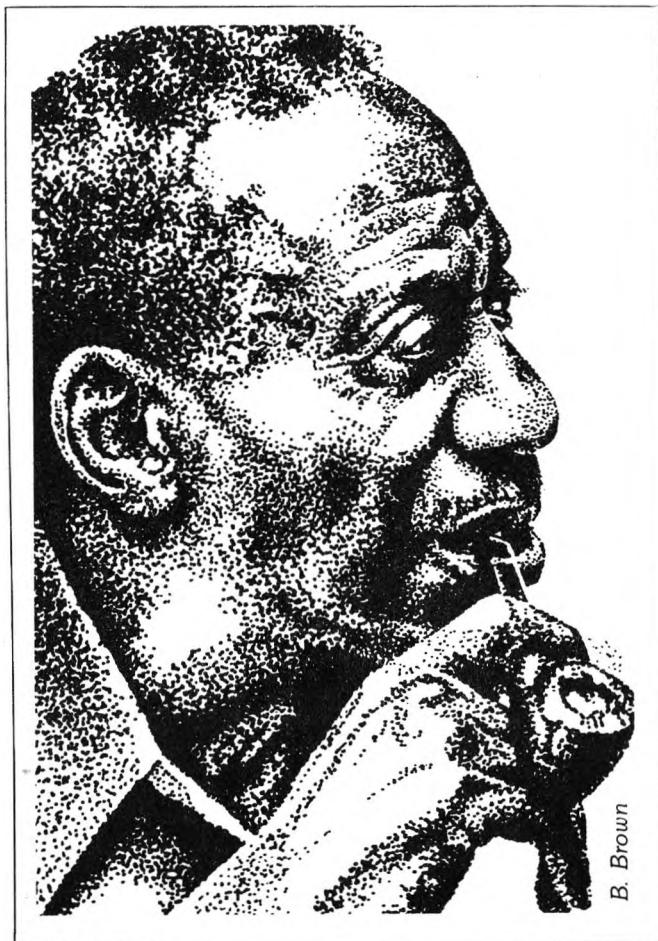
Harry Haywood inspired many younger members of the CPML.

time particularly when I went to Atlanta and met some of the Black comrades there. This one brother wrote some good poetry, but he spoke of things like “crackers.” (You know the way Black folks used to write poetry.) And he submitted a few poems to the Call [the newspaper of the CPML—ed.] The poems weren’t printed because of those words. He didn’t like that too much. And when I read some of his poems, I didn’t like it too much either.