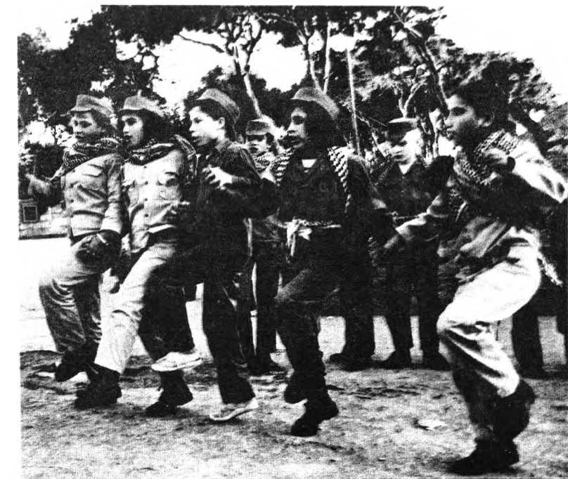
Palestinian culture is expressed even by those too young to have seen their homeland. Here a youth organization in a Lebanon refugee camp performs the dabke, a village folkdance of Palestine.

A: Newspapers are one indication. There were about sixty Palestinian newspapers most of which were critical of the British colonial government. Demonstrations, strikes and occasional armed clashes also were common place. Writers, poets, and professionals and people of all classes wrote, sang, and fought for independence. In 1929, three hundred women took part in a Women's Congress in Palestine. Without the traditional veils these women founded the Arab Women's Union and demanded freedom for Palestinian political prisoners, an end to arms purchases by Zionist forces, and independence for Palestine. By the early 1930's, Palestinian groups recog-