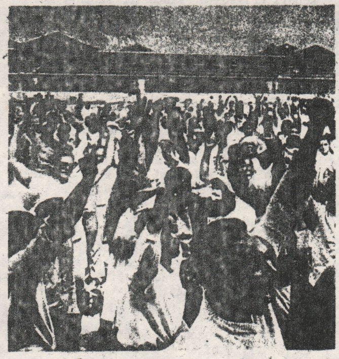
ABOVE LEFT: OVER 2000 DEMONSTRATED IN SUPPORT OF THE ATTICA BROTHERS IN BUFFALO, N.Y. IN SEPTEMBER, 1974. RIGHT: ATTICA PRISON REBELLION OF 1971 BECAME A BATTLECRY SPARKING PRISON REBELLIONS AND MASS SUPPORT THROUGHOUT THE COUNTRY.

"Because all other methods have failed (writs, proposals, seminars, conferences, etc.) like many others, we will go on strike to resolve our problems: on the 23rd day of August, 1976, we, the undersigned inmates of Attica State Prison will go on GENERAL STRIKE and we will continue the survival action until the listed demands are satisfied. The strike will continue as long as nec-