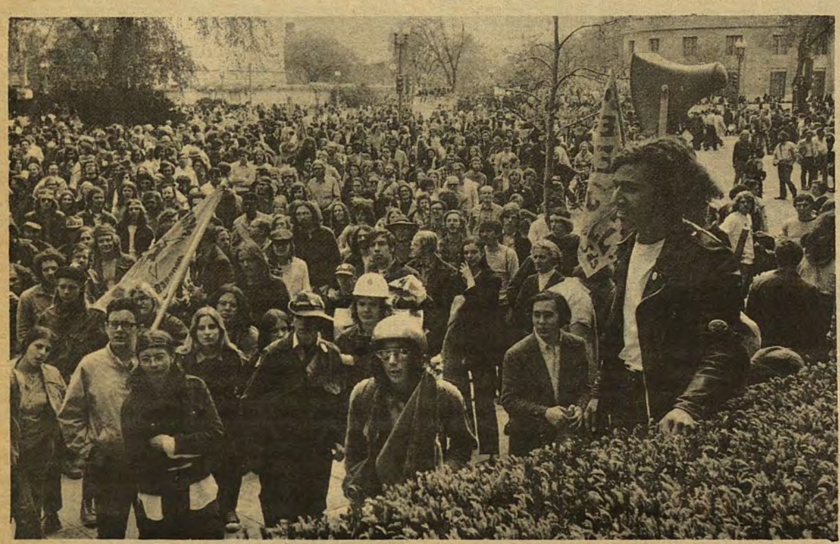
Not a liberal politician in sight

As the liberal politicians and Union hacks droned on, thousands streamed away from the National Peace Action Coalition rally at the Capitol building. NPAC's cop-marshalls, fearing their rotten politics would be exposed, tried to direct students away from the SDS demonstration-saying that it was a cop trap. But thousands walked through their puny "defense" lines.