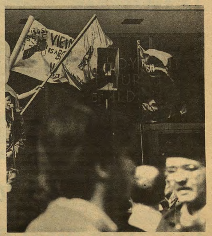
"Vietnam's a Bosses' War, No Layoffs Anymore"