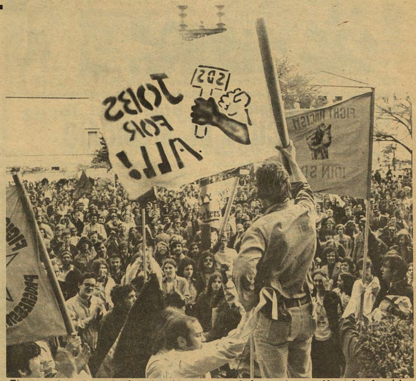
Thousands rejected liberal politicians and the racist, sellout leadership of SMC-NPAC at SDS breakaway demonstration in Washington April 24.

Because of the action at Route 1, the National Guard and police dogs began to sweep the campus and martial law was declared. At about 8 a.m. (continued from Page 12)