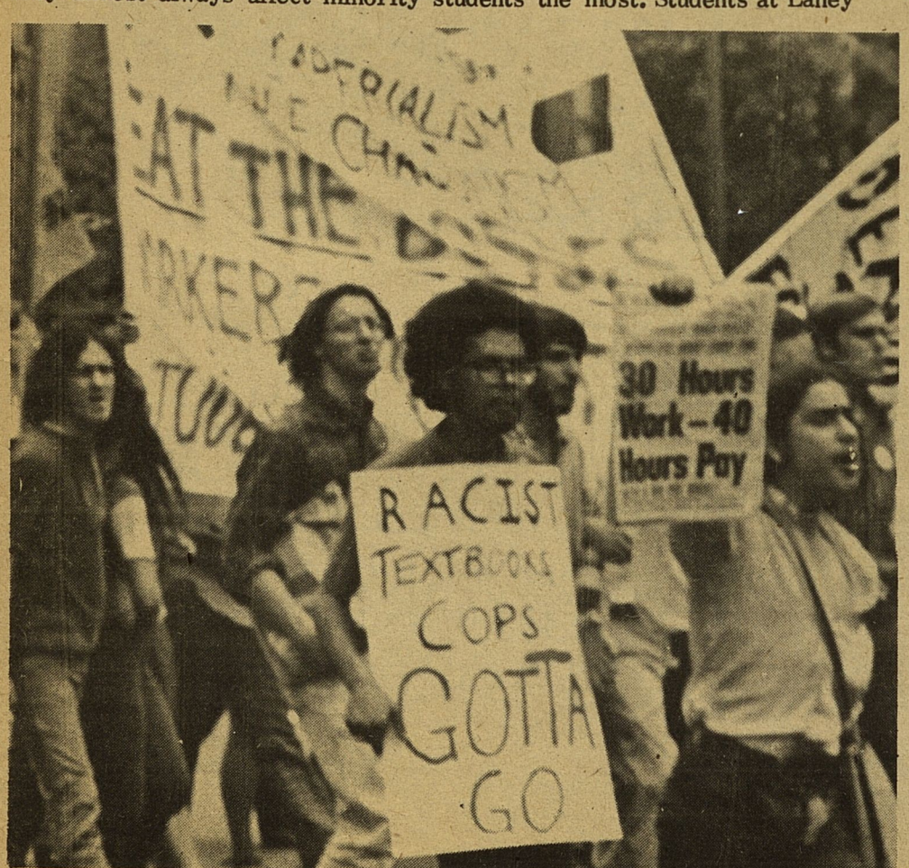
1000 people march to fight racism and demand jobs on Aug. 21 in Washington, D.C. (both pictures).

Junior College in California just went out "On Strike to Demand No Budget Cuts!"