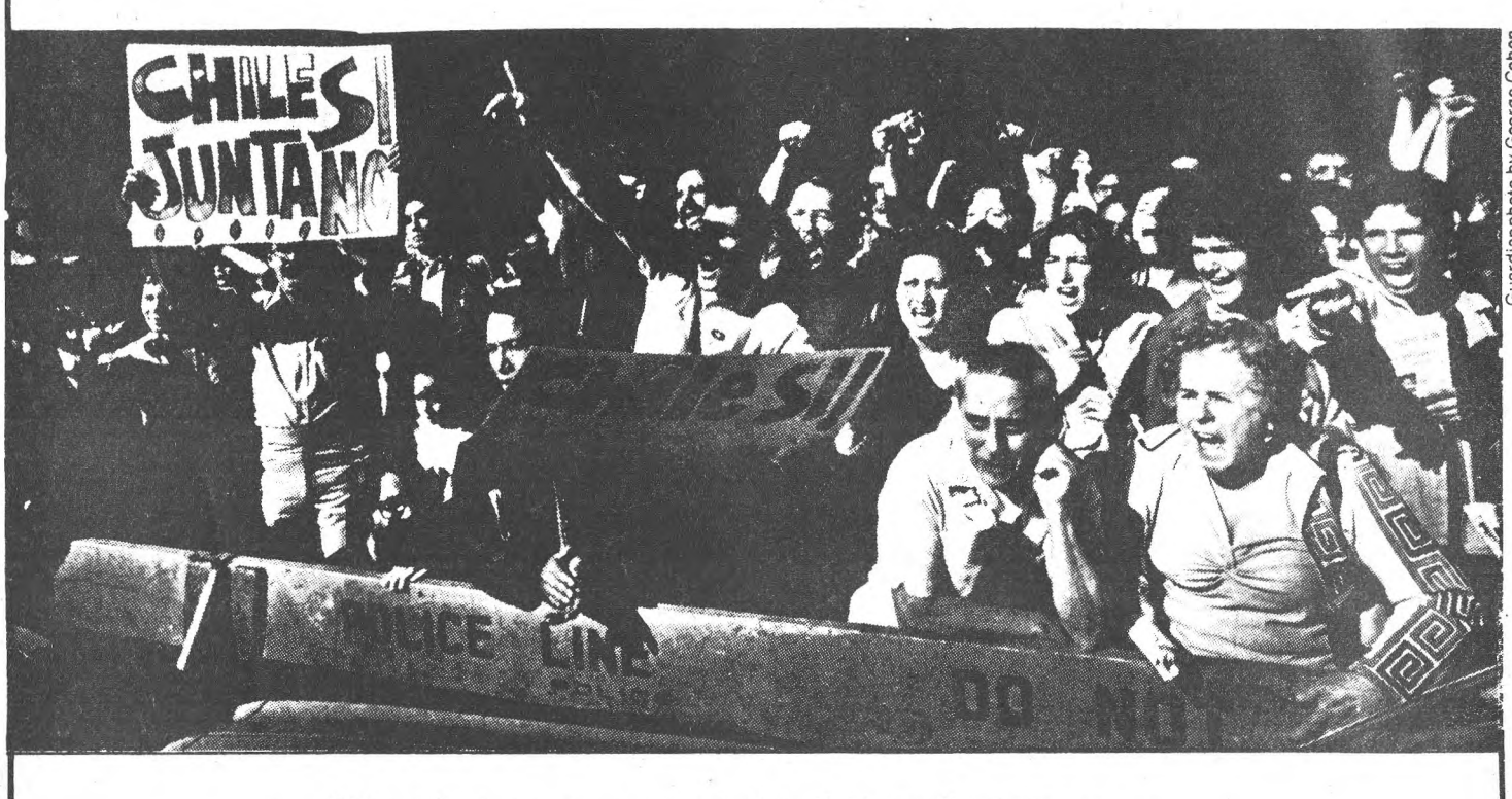
NYC micket in support of the Chilean Resistance ("

Combining diplomatic work and denunciation, with the support of the masses and the work carried out by the solidarity committees, we will implement the tasks we have before us.