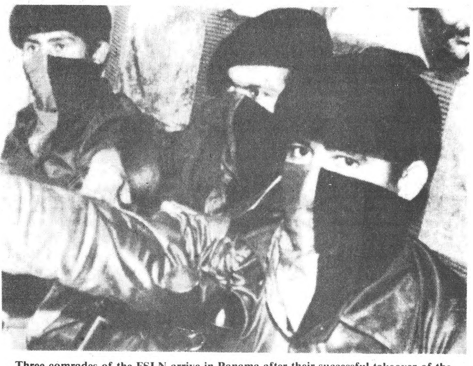
Three comrades of the FSLN arrive in Panama after their successful takeover of the National Palace, August 25, in Managua, Nicaragua.