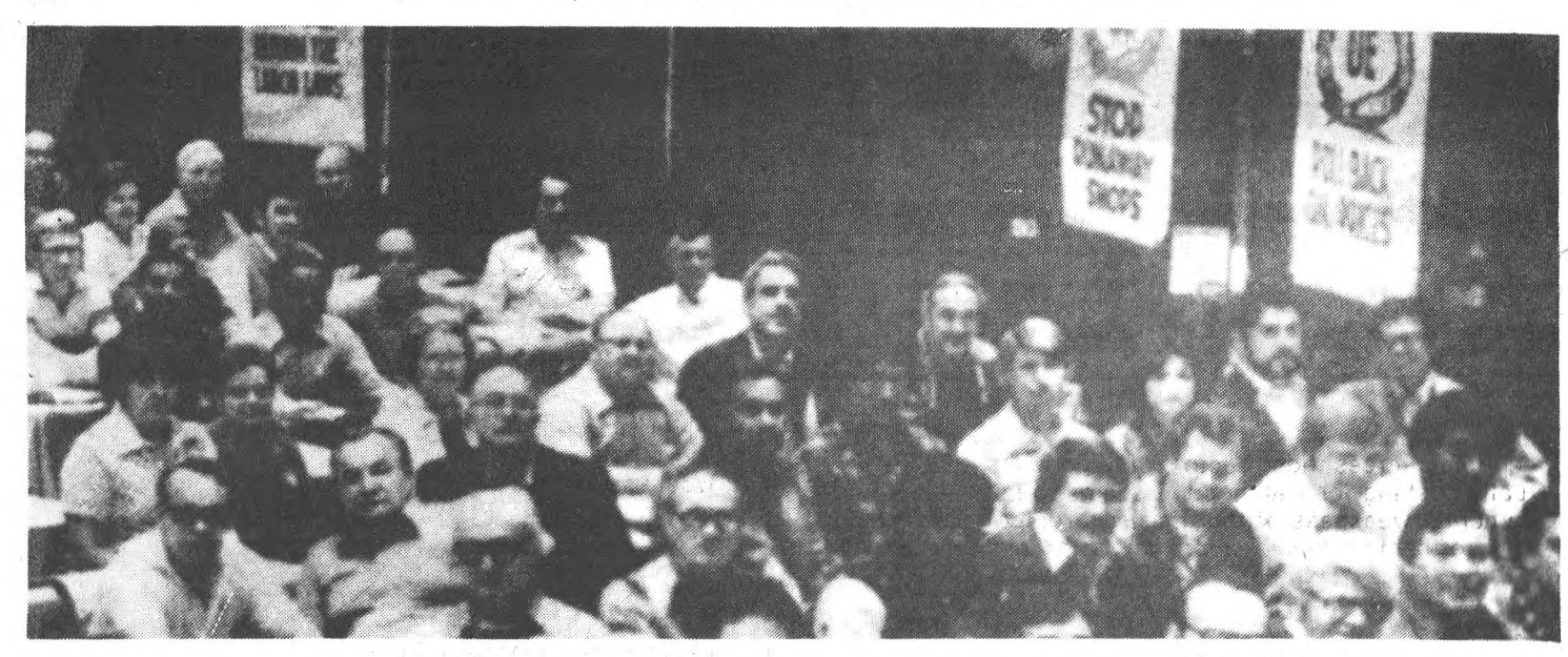
Delegates of the U.E. during a plenary session of their recent convention.

In future articles we will discuss more exdeveloped in such opposite ways. This will be will be beginning on the history of the labor