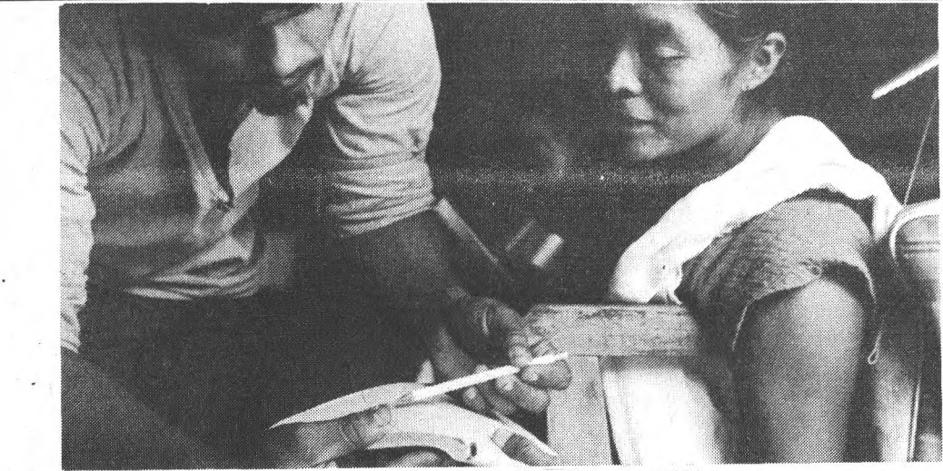
Nicaragua: Alphabetization Campaign 1980.

Today, July 19, 1980, we of MINP-EI Comité join with the Nicaraguan people to joyfully celebrate the first anniversary of their heroic defeat of the Somoza dictatorship. This victory marked a great watershed in the popular, anti-imperialist and revolutionary struggles of Latin America-the first unconditional seizure of state power and true national independence in Latin America since the Cuban Revolution.