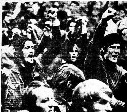
Students in Paul Sauvé Sports Arena in Montreal demonstrate their firm support for Quebec national liberation struggles by raising their fists high in the air and shouting militant slogans.

cont. from page 1: UAW "negotiations" were held between management and union hacks while the Ford workers worked without a contract for 58 days. But today is not 1967, no matter how much the imperialists dream of rolling back the clock to more "peaceful" days, and this time the workers took a firm stand in favor of immediate struggle. Any outward sign of hesitation on the part of the sold-out UAW hacks was swept away in this torrent of class hatred against the imperialists.