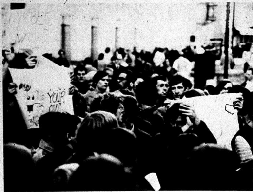
Students at the University of Calgary showed their deep contempt for fascism by holding a rally against the War Measures Act. 1000 students attended the rally. Later, 300 students marched angrily downtown to defy the fascist Act.

Throughout Canada and Quebec, more and more patriotic youth and students are standing up eyeball to eyeball with the reactionary officials, troops, RCMP and police and declaring loud and clear: YOU CAN GET RID OF ME, BUT YOU CANNOT STOP MY IDEAS AND YOU CANNOT STOP THE REVOLUTION!