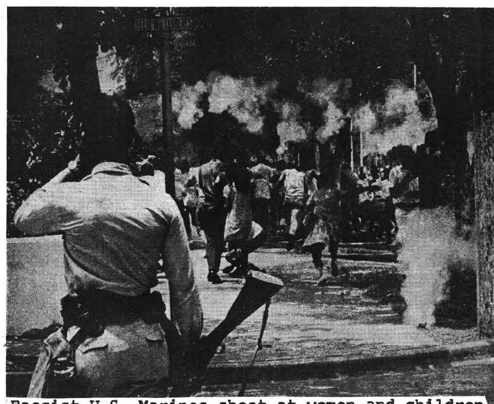
Fascist U.S. Marines shoot at women and children in the Dominican Republic, 1965.