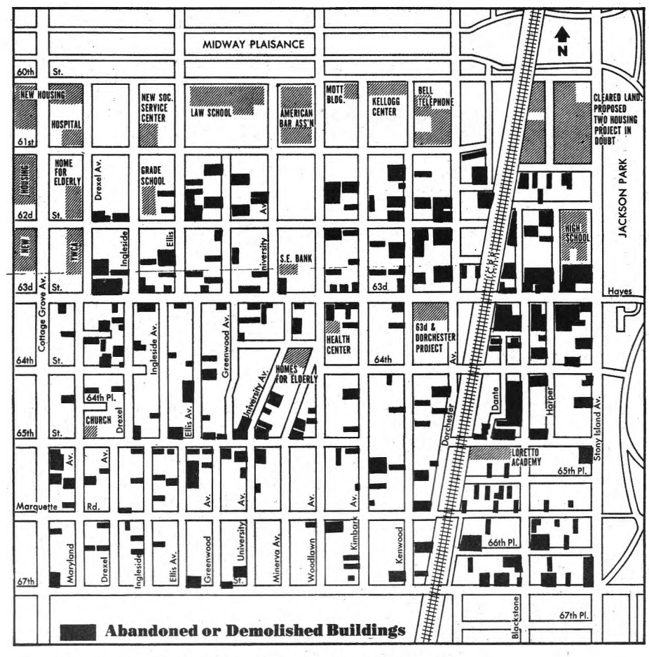
Map of Woodlawn area showing location of vacant, burned-out and razed buildings.