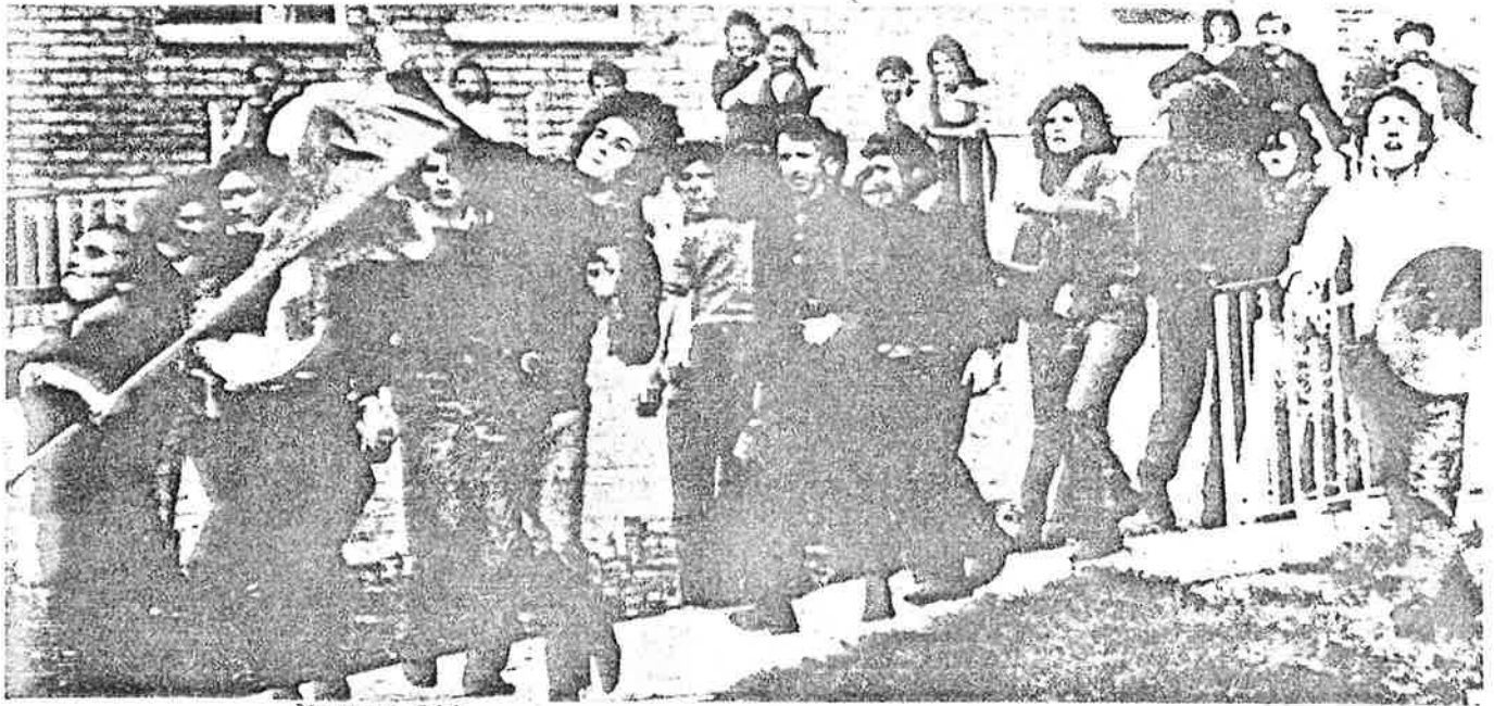
Northern Irish youth hurl rocks at British occupation troops. The Irish struggle for liberation and independence from imperialist domination is a just struggle deserving the support of people all over the world.

The Irish people's struggle against British domination goes back several hundred years. The current struggle in northern Ireland, which is still occupied by the British, is a continuation of this struggle. In 1916, the Irish people began to wage guerrilla war against the occupying British troops. By 1921, they had forced the British to grant independence to all but six counties in the north. However, to this day, British monopoly capitalism maintains economic domination over all of Ireland.